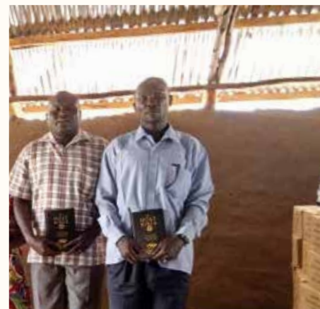
A delivery of Bibles for South Sudanese refugee pastors in Uganda. Previously they were ministering to thousands of fellow-refugees in Uganda without even a copy of God’s Word

or violence, and could not take their Bibles with them when they fled. Some live in countries where the authorities seize and confiscate the Christian Scriptures whenever they find them.