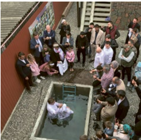
Baptisms at a church in Chechnya

THURSDAY 22 Tatarstan, now a republic in the Russian Federation, has been dominated by Islam for more than a millennium. Tatarstan's Christian community find that their main challenges come from Islamist terrorist groups, not from the authorities. The security situation has improved since 2014 when many Islamists left to fight in Syria and the authorities clamped down on those who remained. However, the authorities warn that a second generation of Islamist militants is expected to emerge – the home-schooled children of Wahhabi Muslim parents, who have been taught to separate themselves from mainstream society and follow a strict and intolerant form of Islam. Pray that these Muslim youngsters may not grow up to hate non-Muslims or believe it right to attack them; ask that each will have a personal encounter with the Lord Jesus Christ.