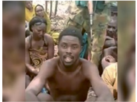
Forestry college students held at gunpoint

released, as were all 39 students, mainly Christians, abducted from a College of Forestry earlier in March. But in April, when a group of Anglican Christians in their church bus were attacked, the Christian driver was shot dead, and four passengers were injured. Another Christian died when a Baptist church was attacked during the Sunday morning service on 25 April. “Glory be to Jesus. We pray for lasting peace in all troubled regions of the country, in Jesus’ Name,” said the pastor of the eight from the Redeemed Christian Church of God after their release. Add your prayers to his.