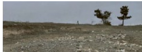
This Armenian church building in Mekhaven, Nagorno-Karabakh, was demolished by Azerbaijani forces after the end of last year's war

THURSDAY 12 The Armenian Christians of Nagorno-Karabakh have been described as “God-fearing, gentle, friendly and hospitable people”. Much of the enclave in which they live was seized by Muslim-majority Azerbaijan last year and many Armenian civilians were tortured and abused, with several dying in captivity. Nagorno-Karabakh is full of spiritual significance to