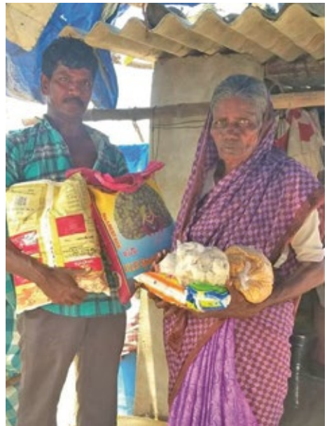
Distribution of food aid from Barnabas to Covid-affected Christians in India

TUESDAY 3 A devastating second wave of Covid-19 began surging across India in mid-March and was still increasing in early May. Amongst the hundreds of thousands of deaths are many church leaders and ministry leaders. Ask the Lord to raise up others to take their places, anointing them with the necessary gifts and giving them strength to handle their challenging task. Frightened congregations, many without income and many sick or dying, need pastoral care. Ministries of all kinds need wise leaders to keep the Lord's work going. We may not know in detail what the needs are today, but our Father knows what our Indian brothers and sisters need before we ask Him (Matthew 6:8).