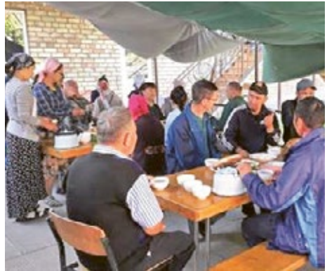
A conference for deaf Christians in Kyrgyzstan. The church premises were provided by Barnabas Fund many years ago

WEDNESDAY 15 There is a very active ministry to the deaf in Kyrgyzstan and many deaf Muslims have turned to the Lord. Typically the converts suffer persecution by relatives and friends. Pray that they will be able to withstand these experiences. The ministry is expanding and new fellowships for deaf believers are being formed in local churches, but more workers are needed, especially sign language interpreters. Ask the Lord of the harvest to send out labourers equipped with the specialist skills needed for this particular harvest field (Luke 10:2).