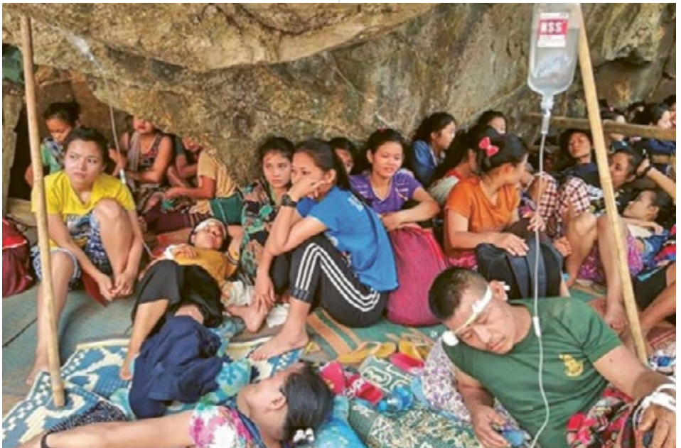
Injured Christians in Myanmar taking shelter in caves in the jungle

THURSDAY 2 The highly infectious Delta variant of Covid-19 has been surging through Myanmar’s Chin region, whose population is mainly Christian. In June 48 pastors died, followed by another nine in the first week of July. A church