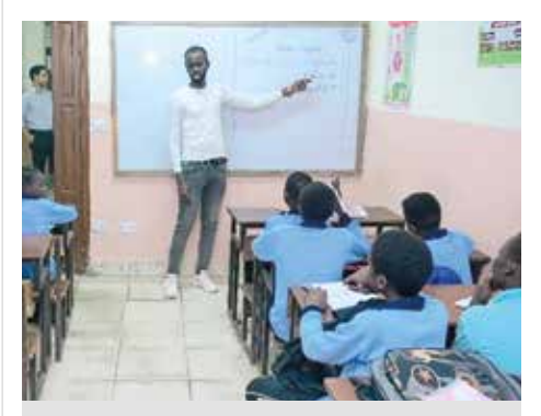
Christian school for Sudanese Christian refugee children in Egypt

Barnabas' support for a Christian school in Cairo. Most of the parents fled to Egypt to escape conflict and persecution in Sudan and cannot afford school fees for their children. Now, with Barnabas supporters' donations, even the poorest refugee children can receive an education. Praise God for transforming Sudanese Christian children's lives and pray that they will flourish in their studies and relationships. Ask for His blessing and encouragement on their parents and teachers as the children grow and learn together in a loving Christian environment.