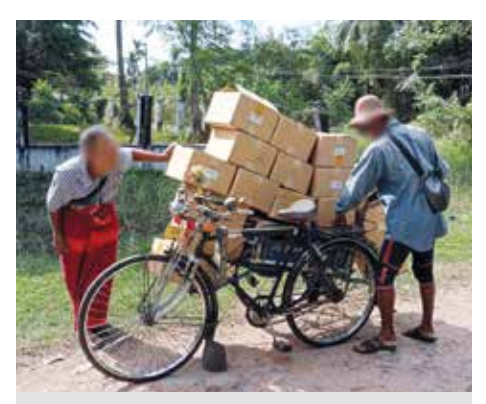
Delivering Bibles to suffering Karen Christians in Myanmar

of Christian songs as well as the Scriptures and are being delivered to Karen Christians in impoverished parts of Myanmar. At the time of writing, the first shipment of 50,000 Bibles is underway. Pray for protection for those carrying out the distribution of the Bibles in Myanmar. Only the most elderly Karen believers can now remember what it was like to live without persecution by their country's military. Pray that God's Word will bring hope and encouragement.