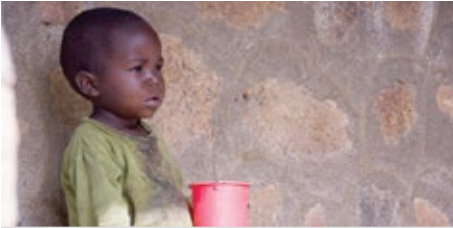
This Nigerian child’s father was killed by Fulani militants. His mother wept with joy to receive food from Barnabas in the midst of Covid lockdown