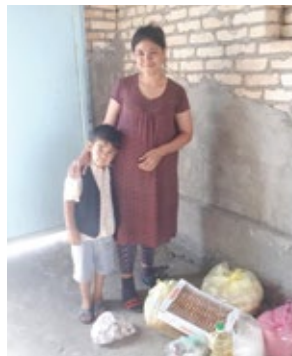
Food aid funded by Barnabas delivered to needy Christians in Turkmenistan. It renewed their hope as well as meeting their physical needs