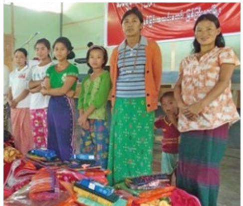
Distribution of aid from Barnabas Fund to displaced Kachin Christians

WEDNESDAY 12 More than 100,000 Kachin people, mainly Christians, are living in internally displaced people’s camps or sheltering in church buildings. Some have been displaced more than once during 40 years of terrible violence against mainly Christian ethnic minorities by the army of Myanmar (Burma). Pray that the Holy Spirit will be at work in the hearts of their persecutors to convict them about their brutal treatment of their fellow citizens. Pray that He may also bring peace, hope and joy to the Kachin believers, enabling them to love and forgive their enemies.